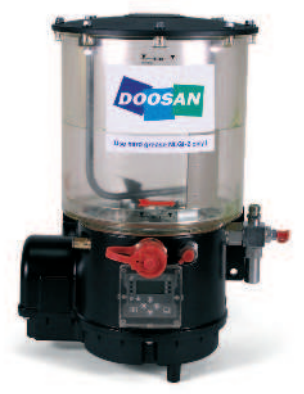
KFG pump unit with integrated control unit

Manual lubrication is a thing of the past – automated centralized lubrication systems are the modern solution. You no longer have to accept the costs and uncertainties of manual lubrication, since DOOSAN large and medium wheel loaders are equipped ex-works with SKF centralized lubrication systems to ensure that these powerful machines perform at their best at all times. But even with a small Doosan wheel loader not factory-fitted with an SKF centralized lubrication system, you don't have to go without automatic lubrication. At SKF and Doosan dealers around the world, you will find experts for advice and installation of the right retrofit solution.